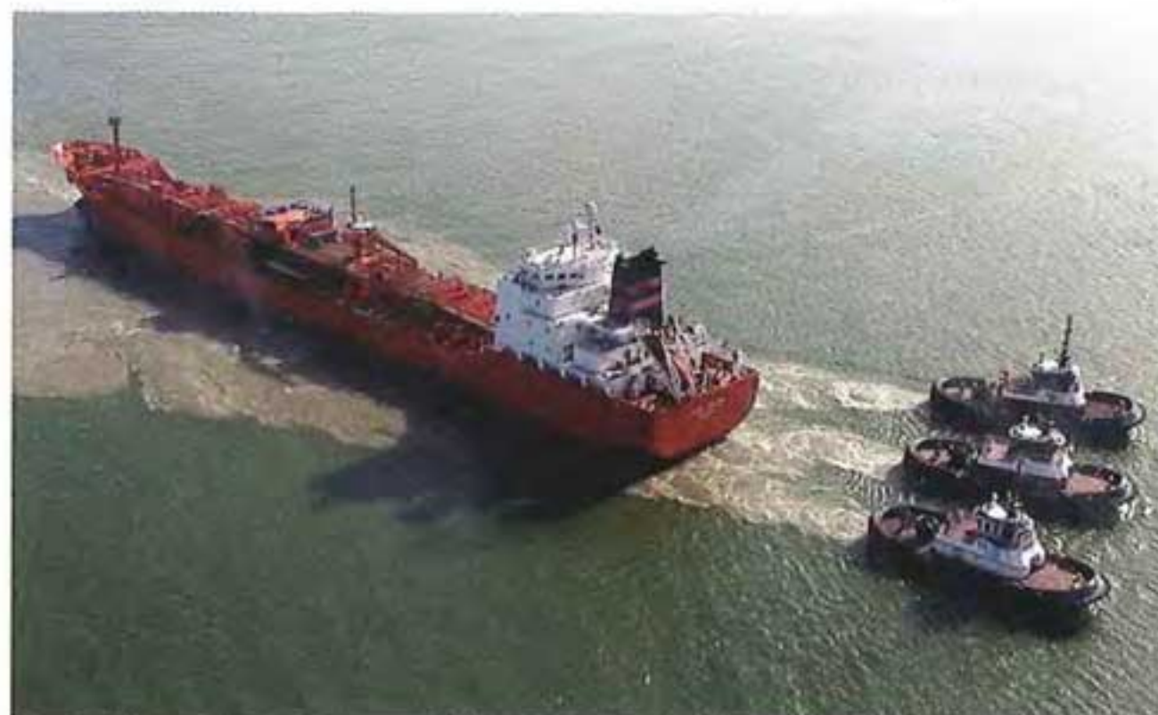
This loaded chemical/product tanker was grounded inside Galveston Bay, Texas. RESOLVE refloated the vessel utilizing four tugs after transferring cargo and deballasting.

RESOLVE managed a fleet of more than 120 vessels and hundreds of personnel engaged in the Gulf effort. To monitor fleet movements and facilitate communications, RESOLVE applied their Resolve Tracking and Response (RTR) technology, a proprietary, satellite-based asset tracking, monitoring and response service designed specifically for vessel and fleet